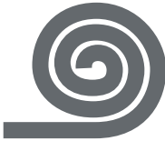
INSULATION & AIR SEALING