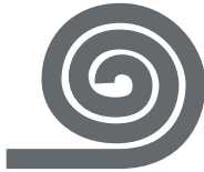
INSULATION & AIR SEALING