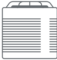
HEATING, COOLING & VENTILATION

Attic/Ceiling Insulation (R-22 or less existing) 4 $400 Knee Wall Insulation 45 Multiple Upgrades Only Wall Insulation (R-0 existing) 45 Multiple Upgrades Only Floor/Crawlspace Insulation (R-0 existing) 45 Multiple Upgrades Only Air Infiltration 45 Multiple Upgrades Only