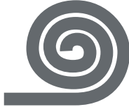
INSULATION & AIR SEALING